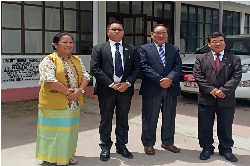
SCIC and SIC's attained at Ziro for RTI act, 2005 Awareness programme on 22/5/2018.