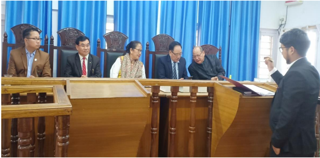
FULL BENCH HEARING ON 12/12/2018