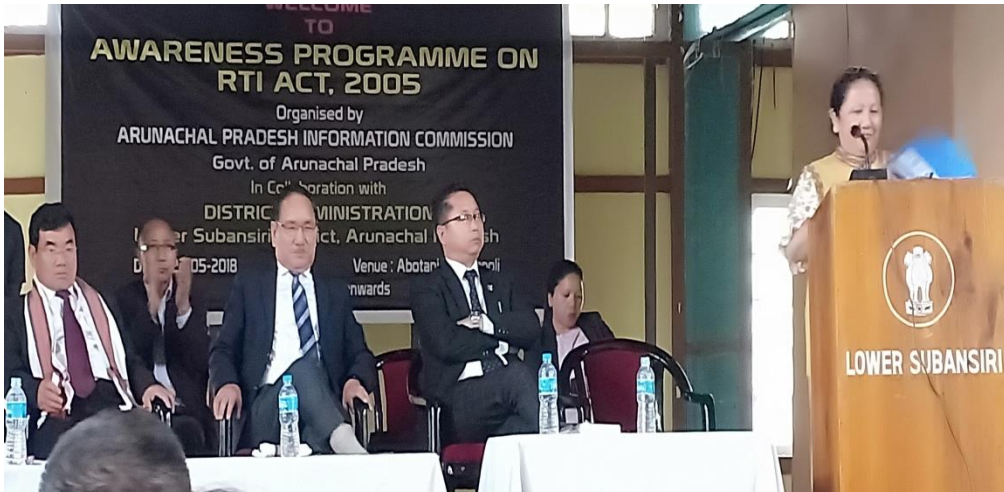
SCIC and SIC's attended at Ziro for RTI act, 2005 Awareness programme on 22/5/2018.