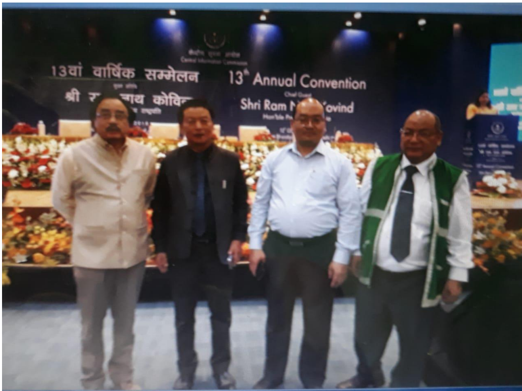
13 th Annual Convention of CIC held at Delhi on 12 th Oct'2018