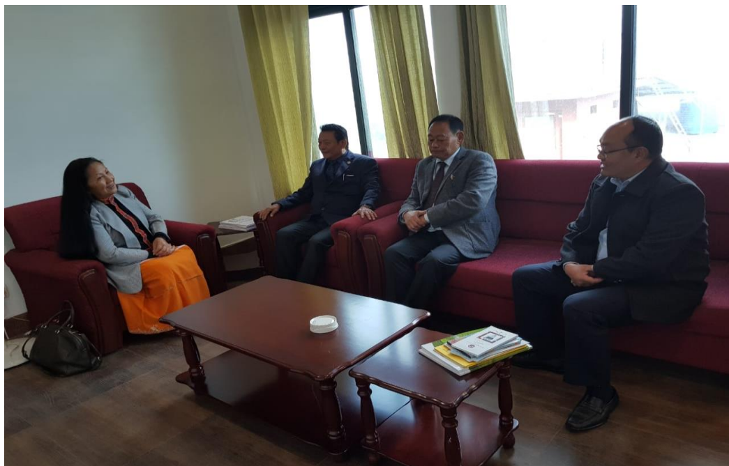
Discussion on RTI Act in both States.