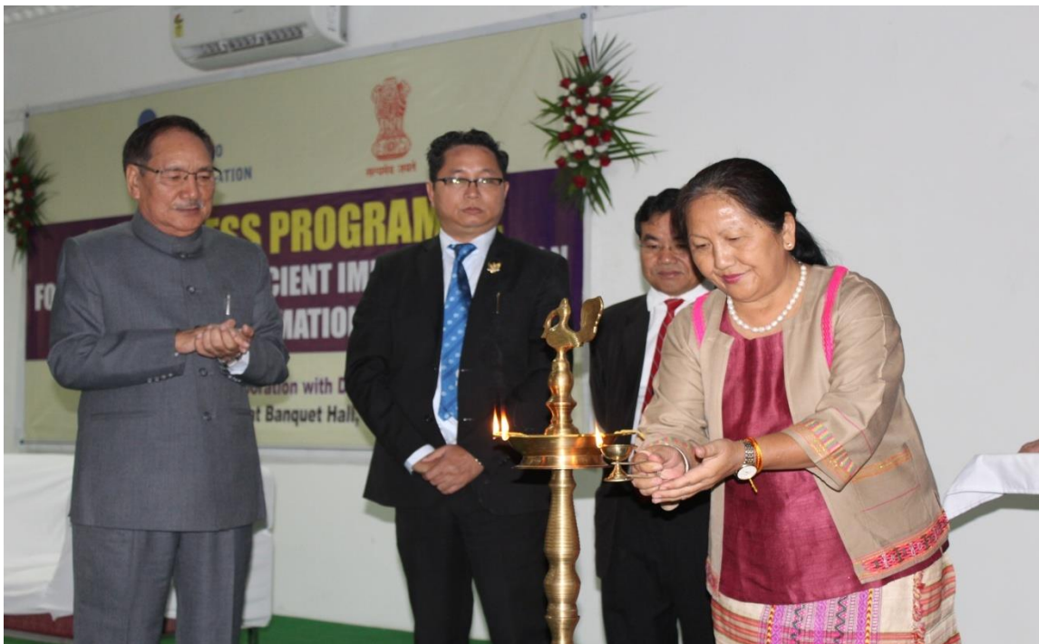
AWARENESS PROGRAMME ON 12TH OCT 2018, ITANAGAR