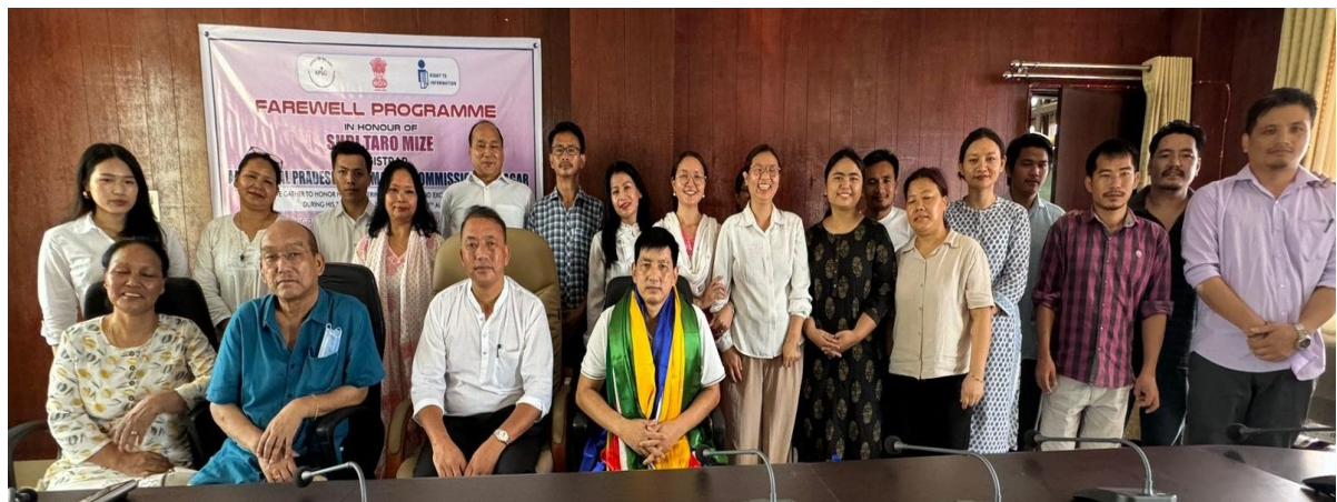
Officers and officials of APIC bid a warm farewell to the outgoing Registrar, honouring his dedicated service to the Commission.